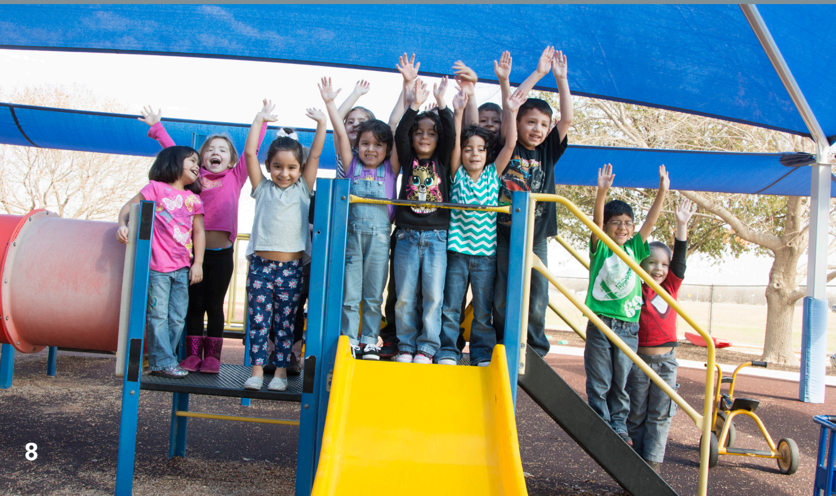
Bottom: Children wave at the San Angelo Early Childhood Center.