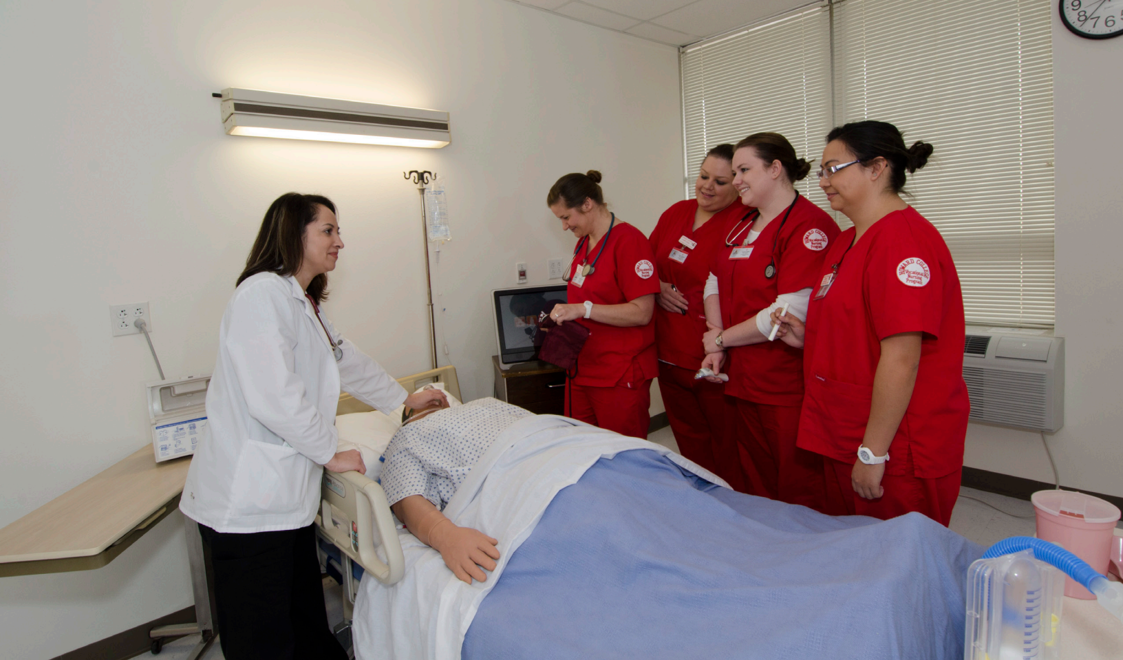
Top: Nursing and health education classes at Howard College San Angelo.