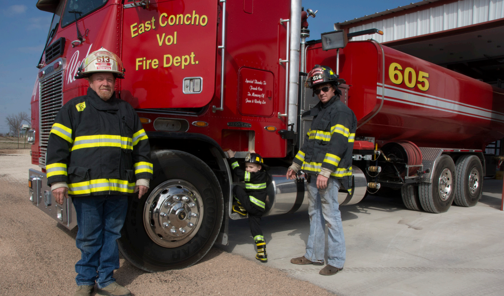
Top: Volunteer fire departments are crucial to our public safety.