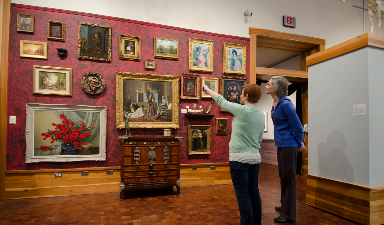
Top: San Angelo Museum of Fine Arts exhibit.