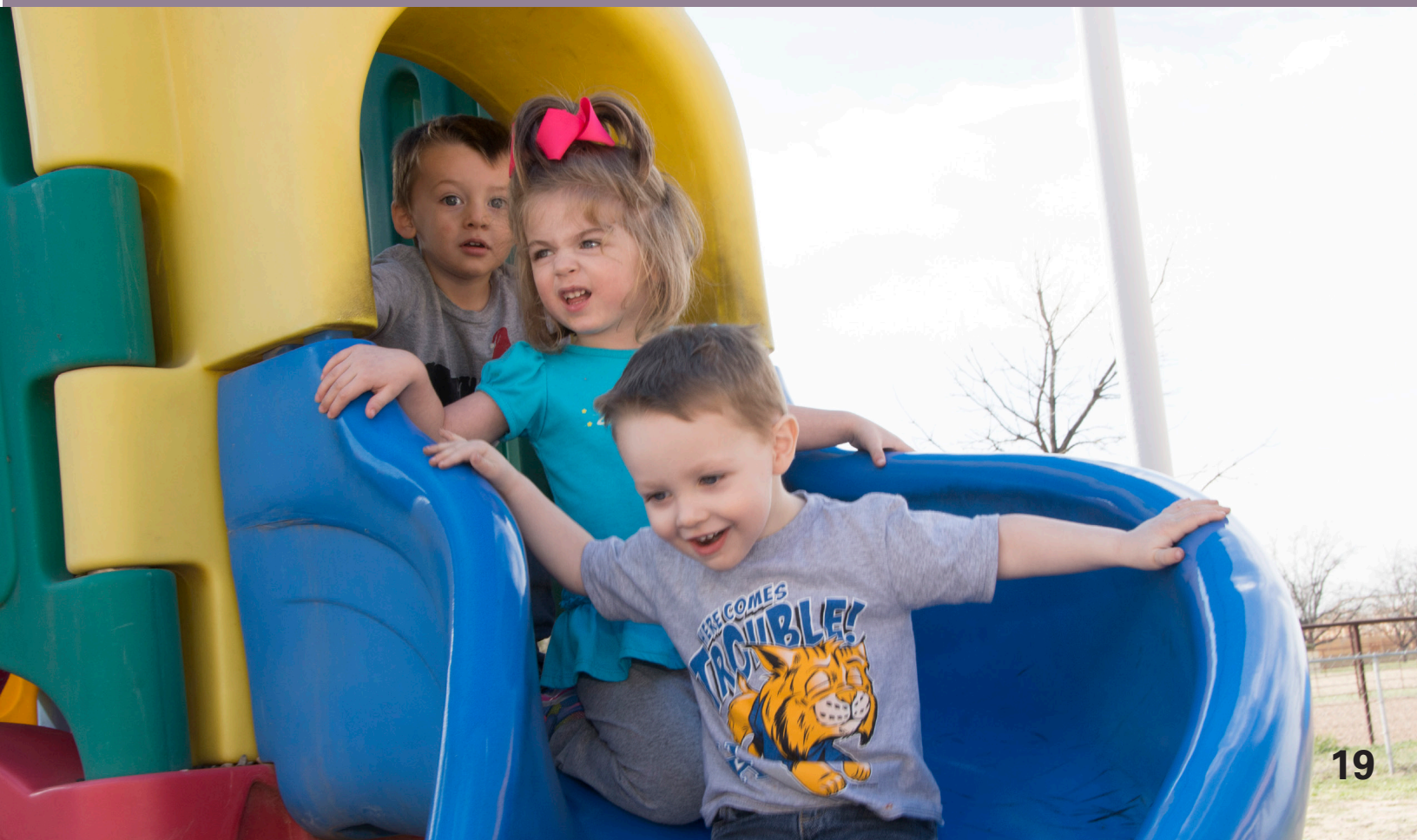
Bottom: Younsters at MOSAIC Redwine Child Care Center.