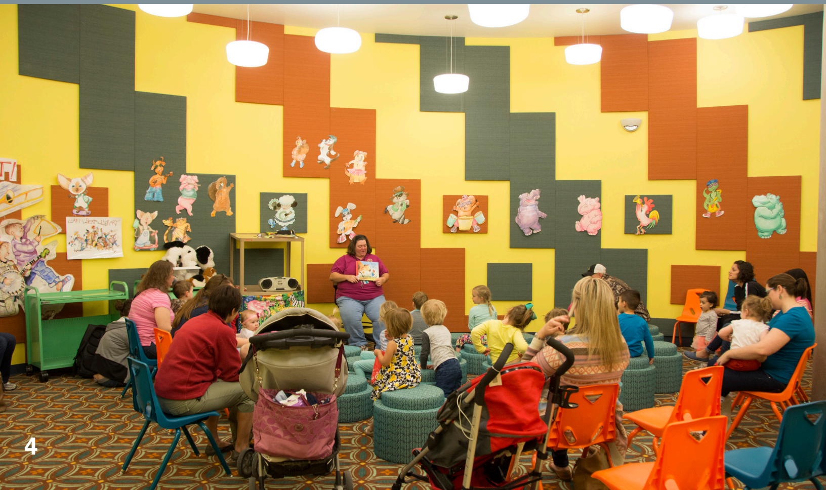
Bottom: Story time at Stephens Central Library.